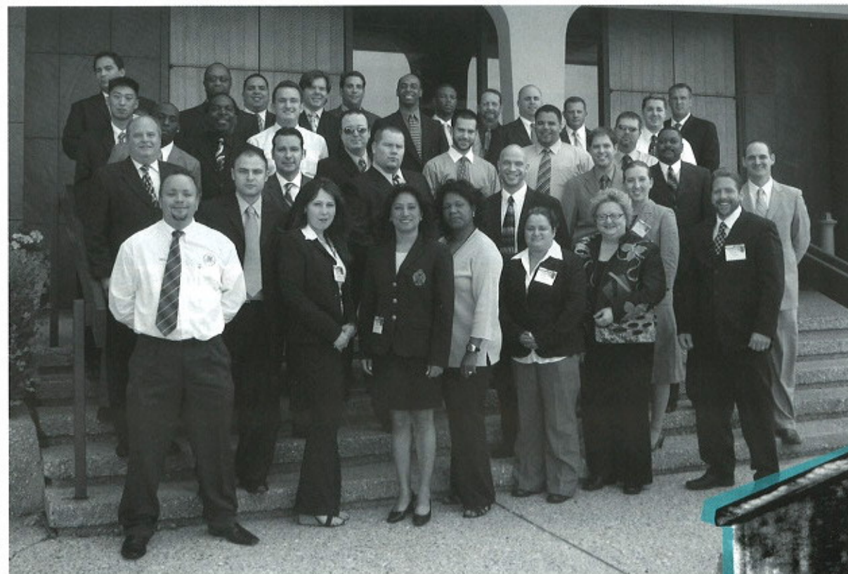
ABOVE: Future leaders from across the country enjoy the chance to get to know their LDS classmates in a more social setting.

The next LDS will be held in September. Speak with your SGA if you would like to attend.